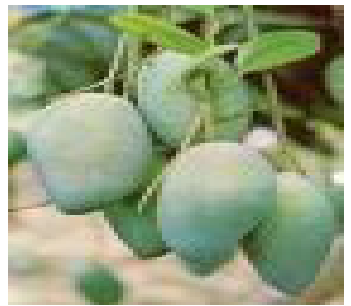
Others are sour.